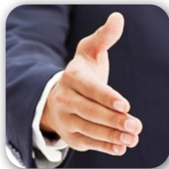
6. Welcome at the Airport