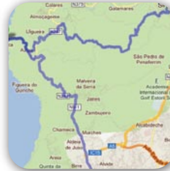
3. Personalized Road Book