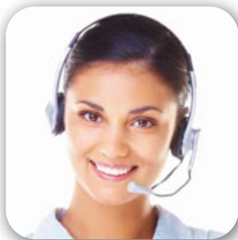
5. Help Line while in Portugal