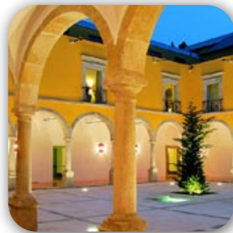
2. Hotels, Activities and Services Bookings