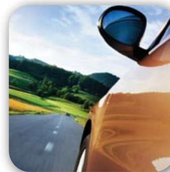
7. Transportation in Portugal