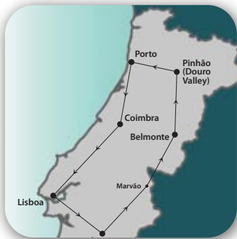
1. Customized Itinerary Planning and Hotel Selection