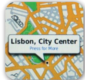
8. Pre-programmed GPS