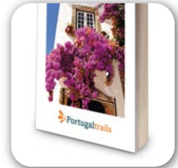
4. Exclusive Guide Book